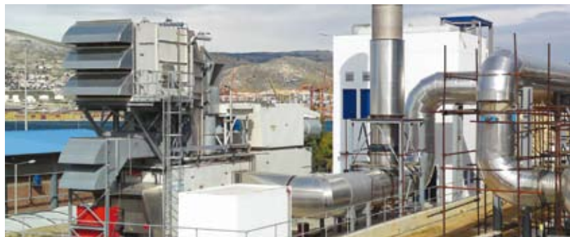
Sewage-sludge drying plant for the City of Athens, on Psytalia island.